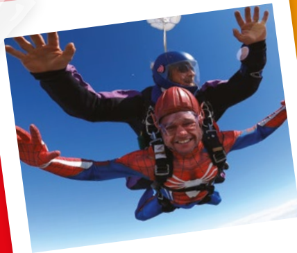
April 13 th Skydive

Spaces available for the team relay, 10k, 5k & junior races