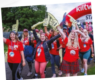
September 15 th Kiltwalk, Edinburgh