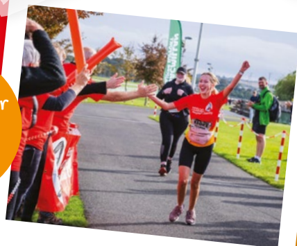
May 25 th – Edinburgh Marathon Festival