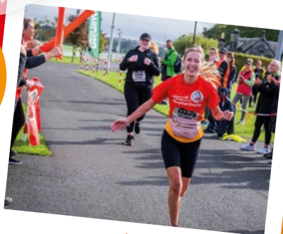
May 24 th /25 th – Edinburgh Marathon Festival