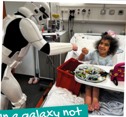
In a galaxy not so far away...

...the bravest young Padawans had the chance to meet some iconic Star Wars baddies in real life, along with everyone's beloved Wookiee, Chewie.