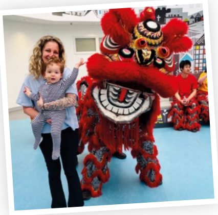
A roaring good time!

Young patients had the chance to dress up in firefighter gear and experience a little of what a rescue might be like. Just like real firefighters, they couldn't see anything during the "rescue" and had to rely on touch to "find the fire" – safely, of course, with no real flames involved!