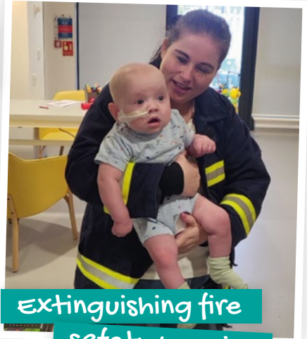
Extinguishing fire safety worries

A huge thank you to Imperial Scottish Garrison for this awesome treat. The Force was strong with every high five and fist bump!