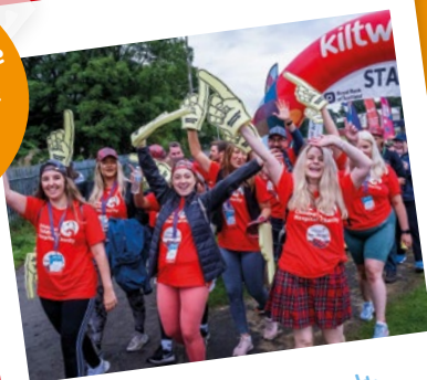
September 14 th Kiltwalk, Edinburgh